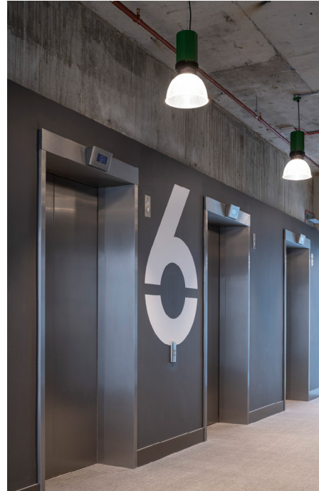
Sixth floor lobby