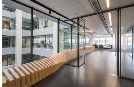
The unit is situated around the central atrium