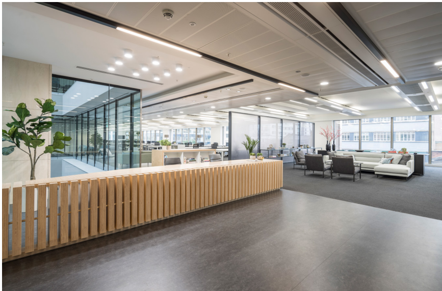
Reception space, breakout areas and desking along Whitechapel High Street